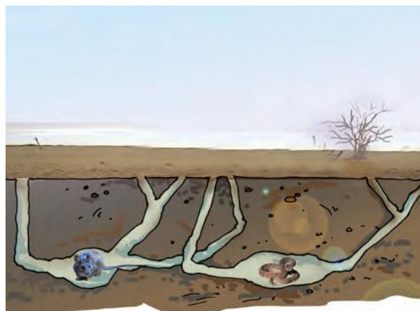
Fig. 6.4 Desert animals in burrows

Bring a potted cactus and a leafy plant to the classroom. Tie polythene bags to some parts of the two plants, as was done for Activity 4 in Chapter 4, where we studied transpiration in plants.