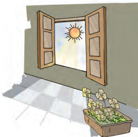
Fig. 6.12 Plant respond to light

it is not growing upright. Do you think, this may be in response to some stimulus?