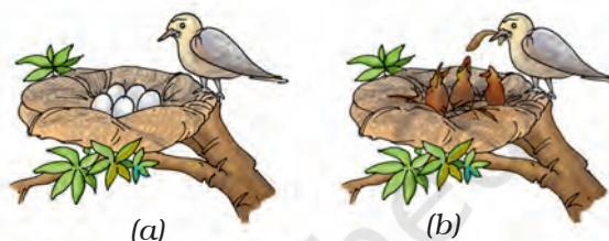
Fig. 6.13 (a) Birds lay eggs which after hatching produce (b) young ones

Many birds lay their eggs in the nest. Some of the eggs hatch and young birds come out of them (Fig. 6.13).