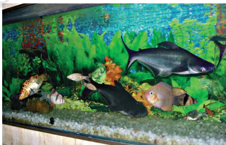
Fig. 6.3 Different kinds of fish