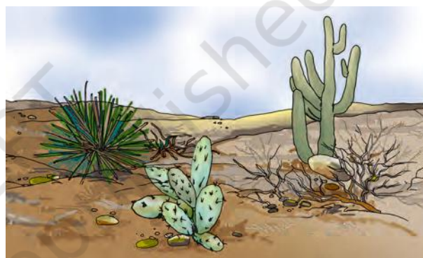
Fig. 6.5 Some typical plants that grow in desert

Leave the potted plants in the sun and observe after a few hours. What do you see? Do you notice any difference in the amount of water collected in the two polythene bags?