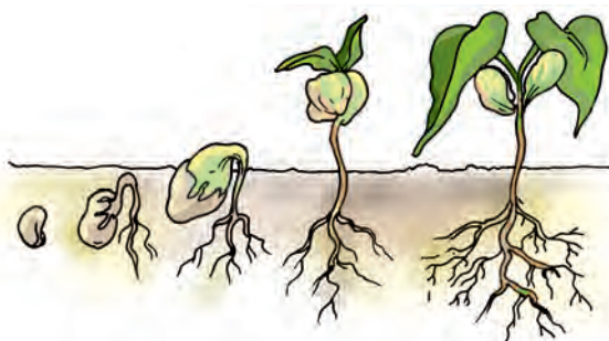
Fig. 6.15 A seed from a plant germinates into a new plant

which can germinate and grow into new plants (Fig. 6.15).