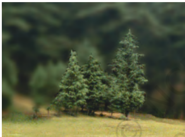
Fig. 6.6 Trees of a mountain habitat

There is a large variety of plants and animals living in the mountain regions. Have you seen the kind of trees shown in Fig. 6.6?