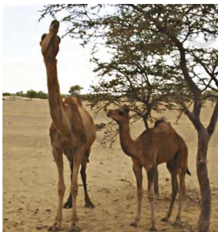
Fig. 6.2 Camels in their surroundings

The plants and animals that live on land are said to live in terrestrial habitats . Some examples of terrestrial habitats are forests, grasslands, deserts, coastal and mountain regions. On the other hand, the habitats of plants and