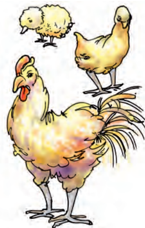
Fig. 6.11 A chicken grows into an adult

The process of breathing in animals like cows, buffaloes, dogs or cats is similar to humans. Observe any one of these animals while they are taking rest, and notice the movement of their abdomen. This slow movement indicates that they are breathing.