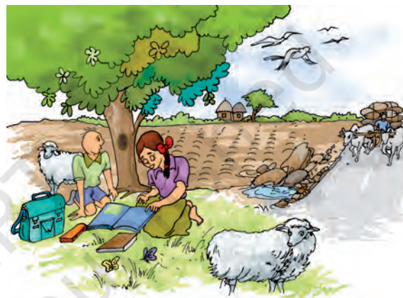
Fig. 6.1 Search for living organisms

of some kind or the other (Fig. 6.1). Paheli started thinking and reading about far away places. She read that people have even found tiny living organisms in the openings of volcanoes!