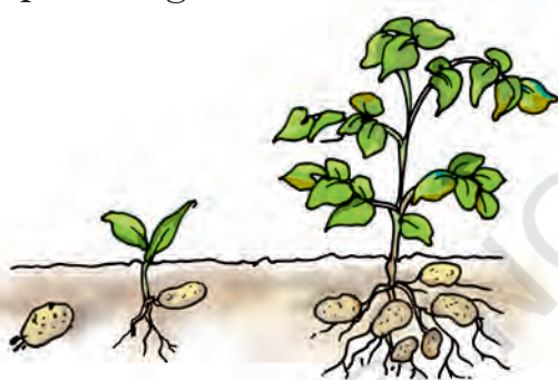
Fig. 6.16 A new plant grows from a bud of potato

Some plants also reproduce through parts other than seeds. For example, a part of a potato with a bud, grows into a new plant (Fig. 6.16).