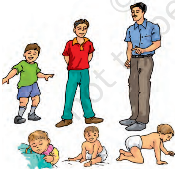
Fig. 6.10 A baby grows into an adult

Young ones of animals also grow into adults. You would surely have